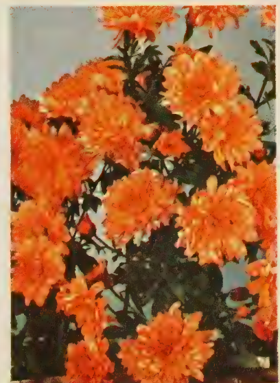
BRONZE CUSHION. 50c each; 3 for $1.25